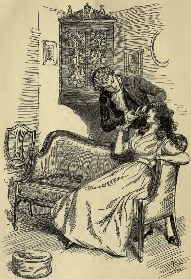
He cut off a long lock of her hair.